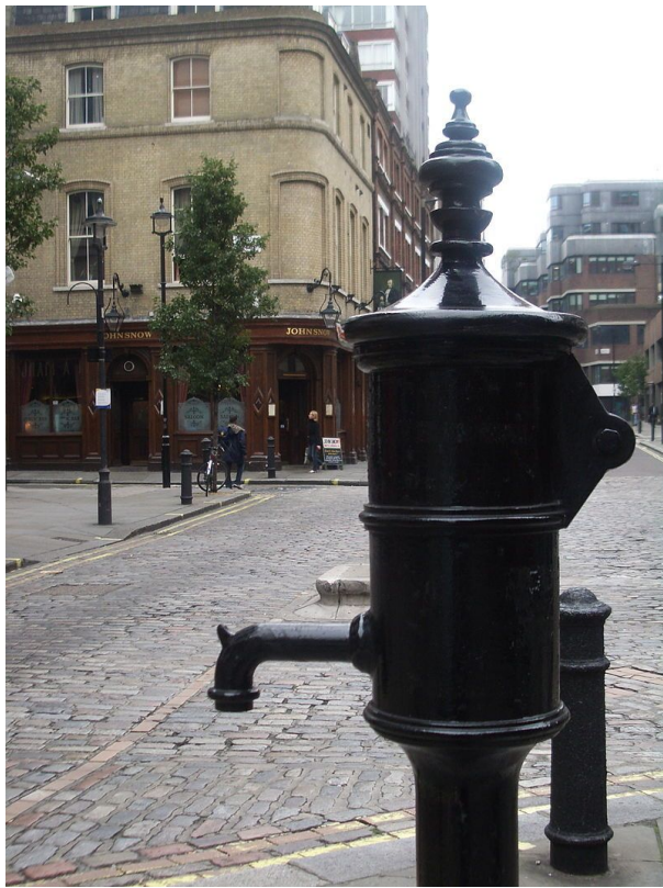
Broadwick Street, showing the John Snow memorial and pub